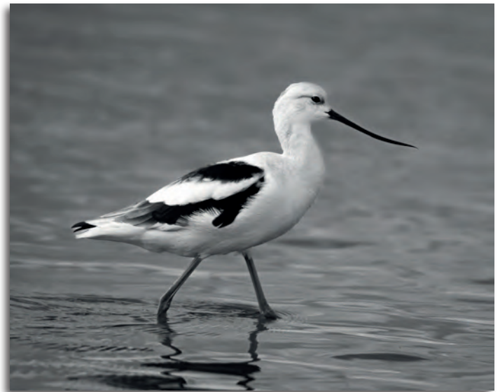
3 rd "American Avocet ( Recurvirostra americana)" Merced National Wildlife Refuge"