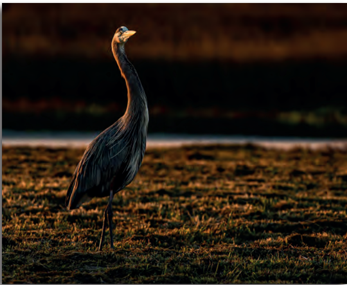
2 nd "Great Blue Heron ( Ardea herodias )" Bill Shewchuk