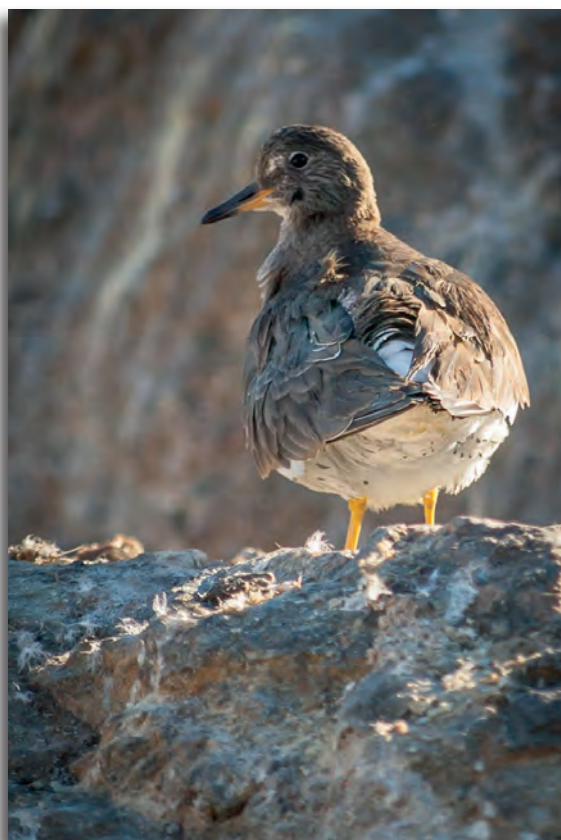
HM "Surfbird ( Calidris virgata)"