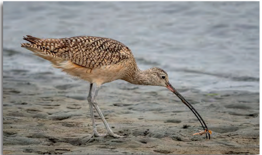
HM "Long-billed Curlew ( Numenius americanus ) Capturing California Ghost Shrimp ( Neotrypaea californiensis )" Mary Ann Avera