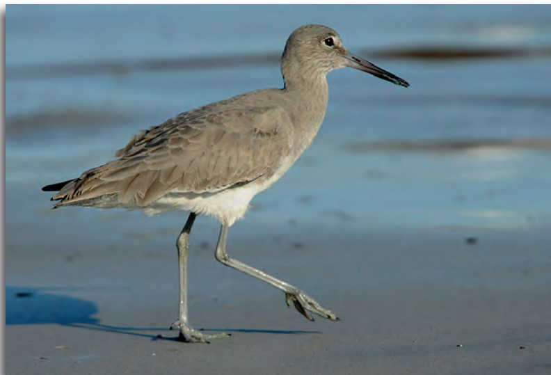
2 nd "Western Willet ( Tringa semipalmata inornata ) Stepping Out" Ken Jones