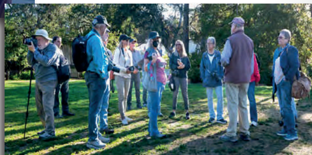
"Photographers Gather for Photo Walk" Charlie Gibson