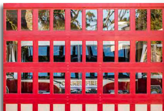
"New in Old" Rick Verbanec