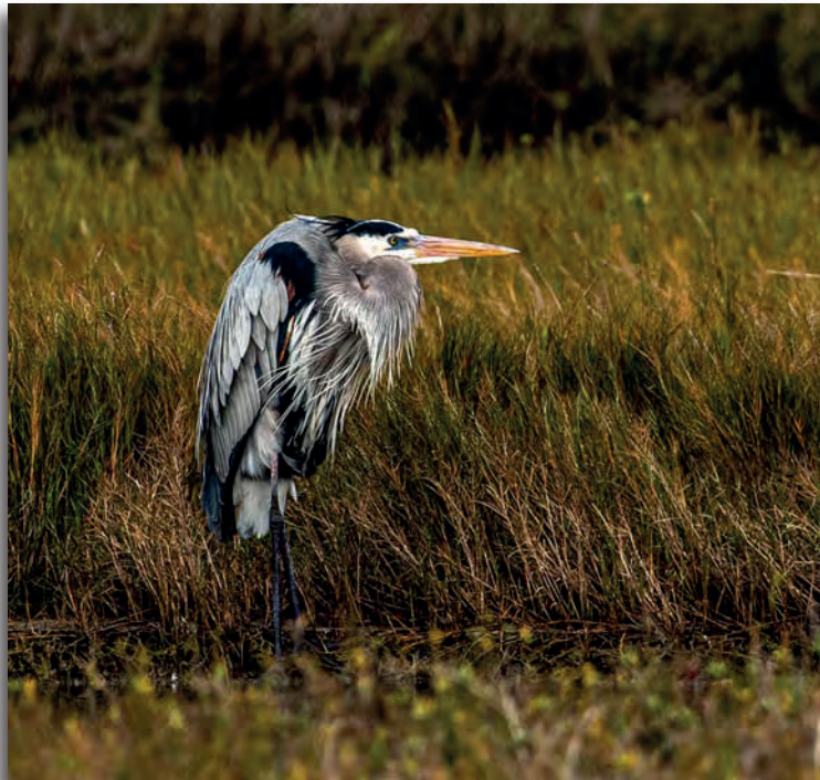
HM "Great Blue Heron ( Ardea herodias ) in Coastal Texas" Bill Sherwchuk