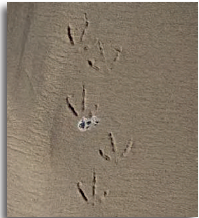
HM "lvl 1 Tracker" Sean Crawford

Level One Tracker, or "lvl 1 Tracker" is in reference to video games rather than any birding or wildlife experience. The photographer chose to make a joke for the competition.