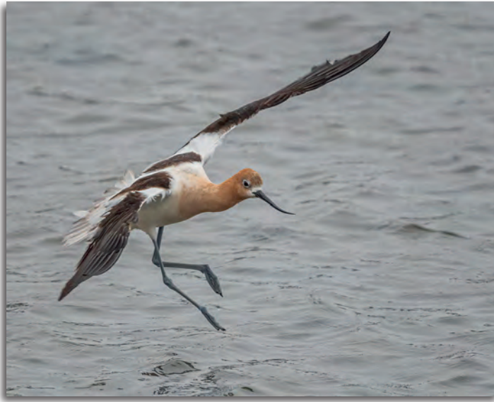
HM "American Avocet ( Recurvirostra americana) in Flight"