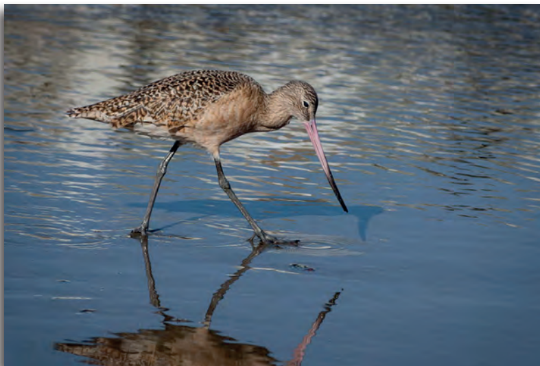
1 st "Marbled Godwit ( Limosa fedoa)"