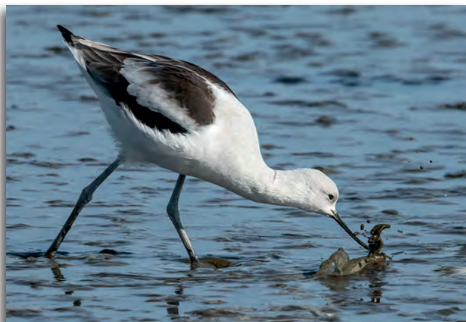
2 nd "American Avocet ( Recurvirostra americana )" Chris Johnson

This month's competition solicited photos of shorebirds and wading birds. This includes those birds that rely on beaches or wetlands for feeding, resting, and nesting. There are over ninety species found locally on the shores, marshes, and estuaries of the Monterey Bay National Marine Sanctuary, of which thirty are dominant.