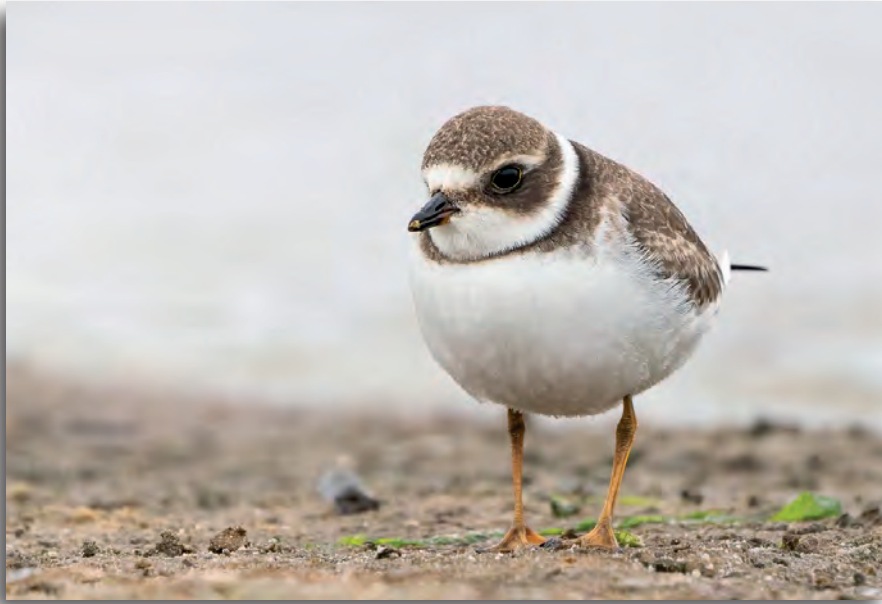
1 st "Semipalmated Plover ( Charadrius semipalmatus )" Julie Chen