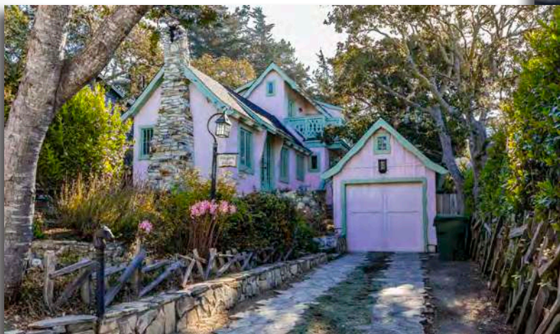
"Storybook Cottage" Rick Verbanec