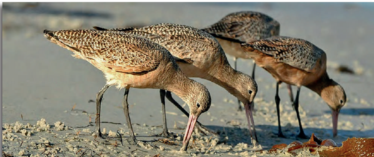
3 rd "Nonbreeding Marbled Godwits ( Limosa fedoa ) Digging Deep for Food" Ken Jones