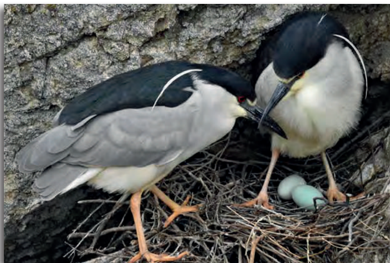
HM "A Pair of Black-crowned Night-Herons ( Nycticorax nycticorax )" Jerry Loomis