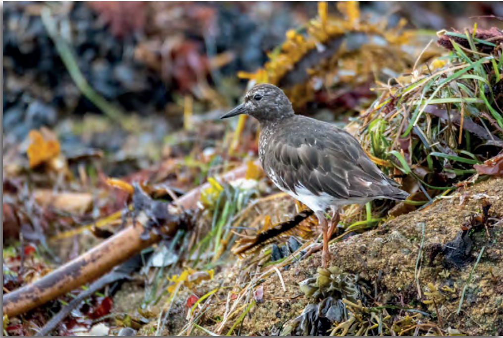
HM "Black Turnstone ( Arenaria melanocephala ) at Fanshell Beach" Charlie Gibson