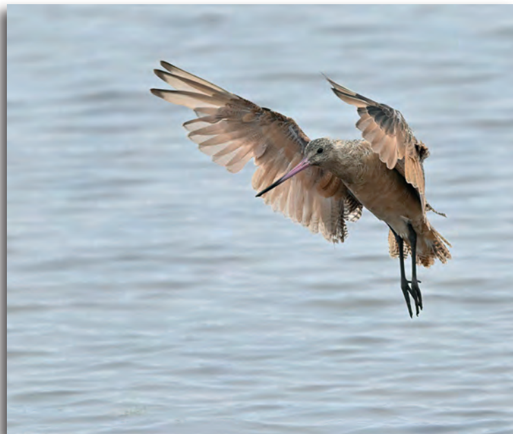
3 rd "Flight of the Marbled Godwit ( Limosa fedoa )" Jeff Hobbs

This month's competition solicited photos of shorebirds and wading birds. This includes those birds that rely on beaches or wetlands for feeding, resting, and nesting. There are over ninety species found locally on the shores, marshes, and estuaries of the Monterey Bay National Marine Sanctuary, of which thirty are dominant.